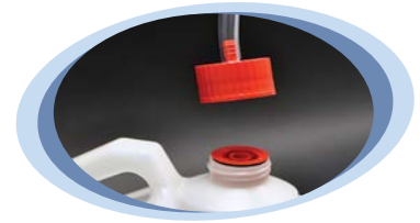
Safe Link Closed Loop Chemical Management System for easy use of chemicals and change-out

GALAXY has a sleek design and modern appearance in any housekeeping environment, plus multiple features to enhance productivity and dispensing flexibility. With AccuPro technology, eliminate dilution variance and ensure you are never using too much or too little chemical. You will always be dispensing the right amount!